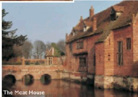
The Moat House

This rare survivor of a 15th Century service building contains our working dairy, bakehouse, brewhouse and stillroom.